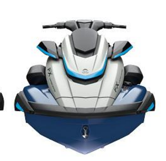
FX CR SVHO