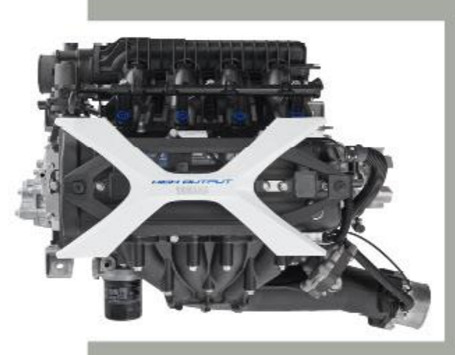
1.9L HIGH OUTPUT ENGINE