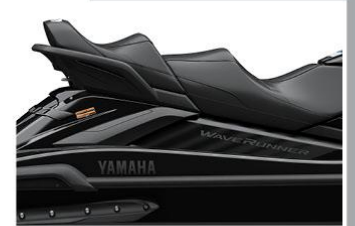
THEATRE STYLE SEAT