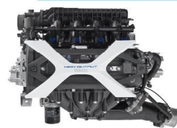
1.9L HIGH OUTPUT ENGINE