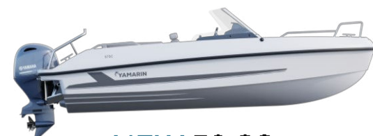
NEW 59 SC