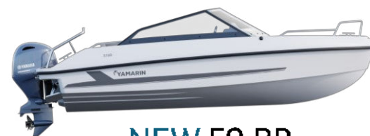
NEW 59 BR