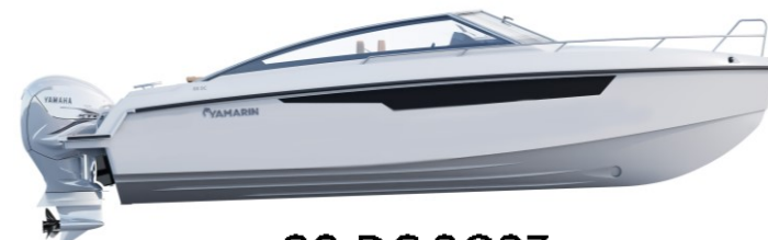
88 DC 2023