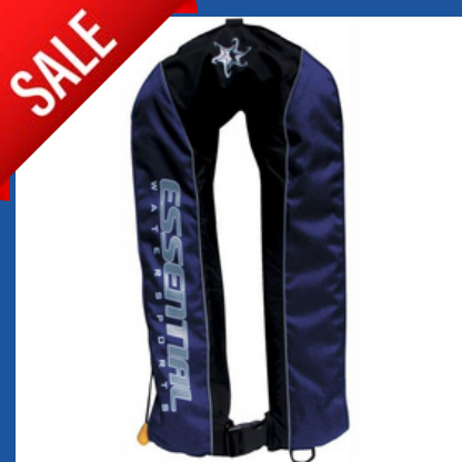
DELUXE 150N MANUAL INFLATABLE PFD $89 EA