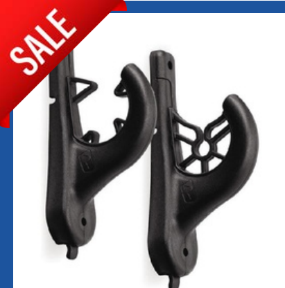
RAILBLAZA RODRAK ROD HOLDERS $32.99