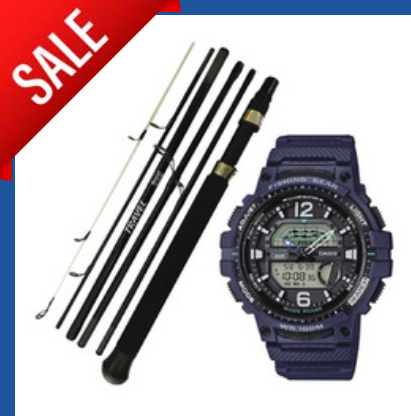
CASIO TIDE & TIME WATCH + TAKE APART SPIN ROD $99