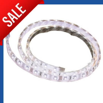
1M LED STRIP LIGHT $14.99