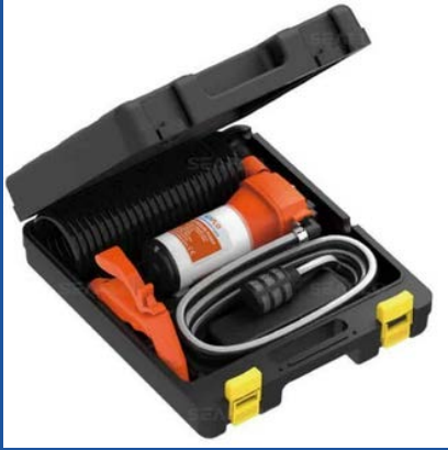
SEFLO 4.5GPM COMPLETE PORTABLE WASHDOWN KIT $259.00

Lowrance Hook 4x with bullet transducer & GPS - It's compact form is perfect for kayaking and features GPS plotter.