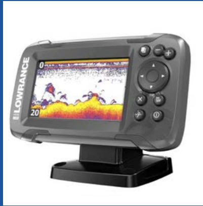
LOWRANCE HOOK 4X WITH BULLET TRANSDUCER & GPS $189.00